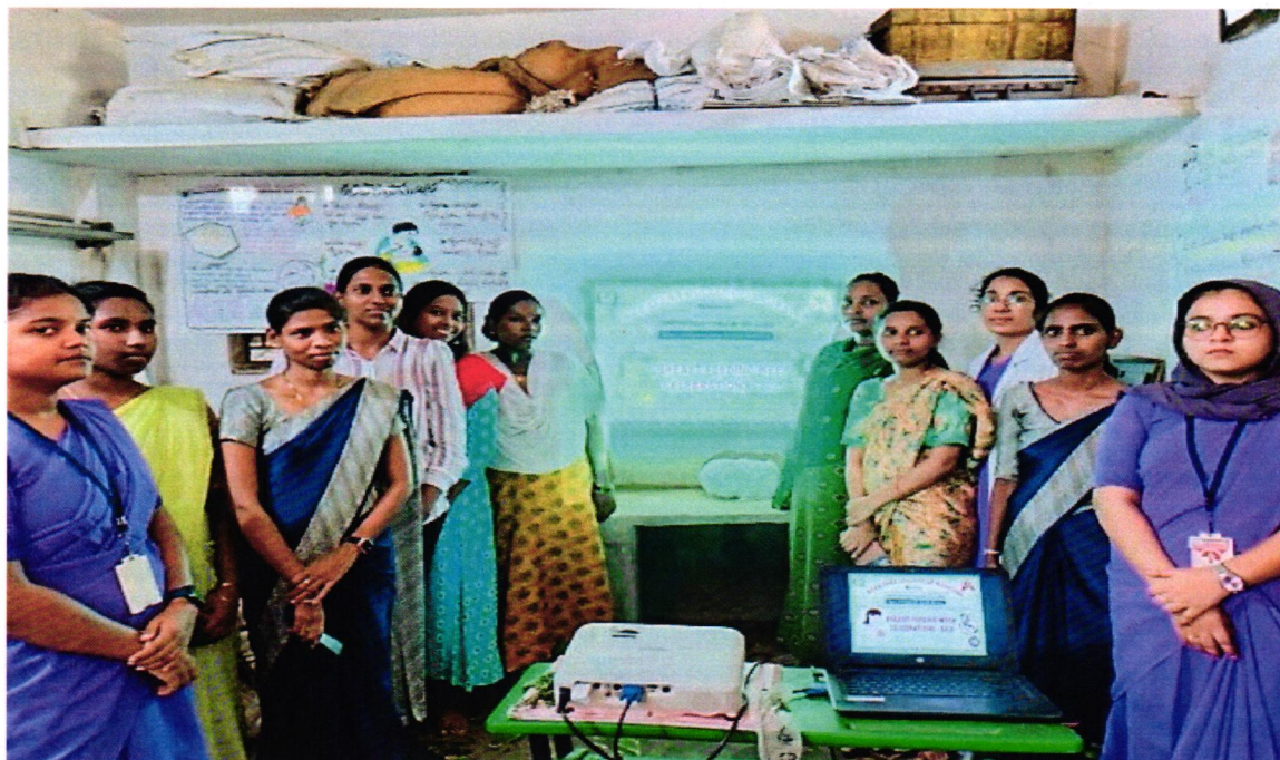
Fig:2 Skit on importance of Breast feeding

The Program was ended with the vote of thanks by K Kantha followed by National Anthem.